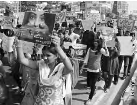
Marching for women's rights

It was no small feat. A 2003 attempt to reach agreement on a declaration to end violence against women failed. And from all reports it looked like this