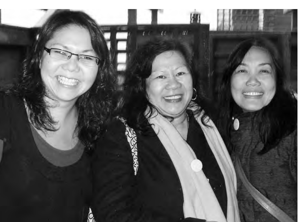
HEU members on the doorstep: On March 2, two dozen HEU members and staff descended on Vancouver-Fraserview to talk to fellow members about the upcoming election.

Member-to-member phone banks are happening across the province, including in Vernon, Kelowna and Prince George. HEU's Comox local