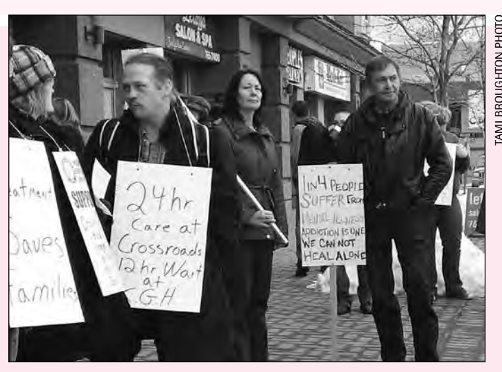
A January rally by HEU and BCGEU members called for IHA to keep Crossroads open.

Despite a community-wide fightback to stop the closure of non-profit Crossroads