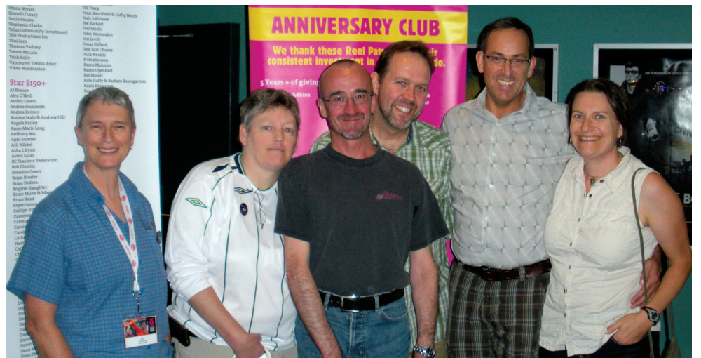
The 'gang' at this year's Vancouver Queer Film Festival.