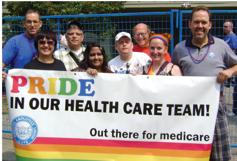
Vancouver: Multi-Union Pride - and our new Out There for Medicare banner!

members on the town, at events and in the community