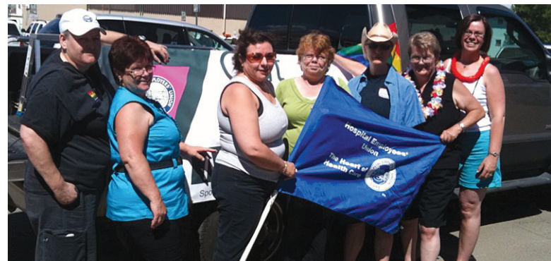
Prince George Pride