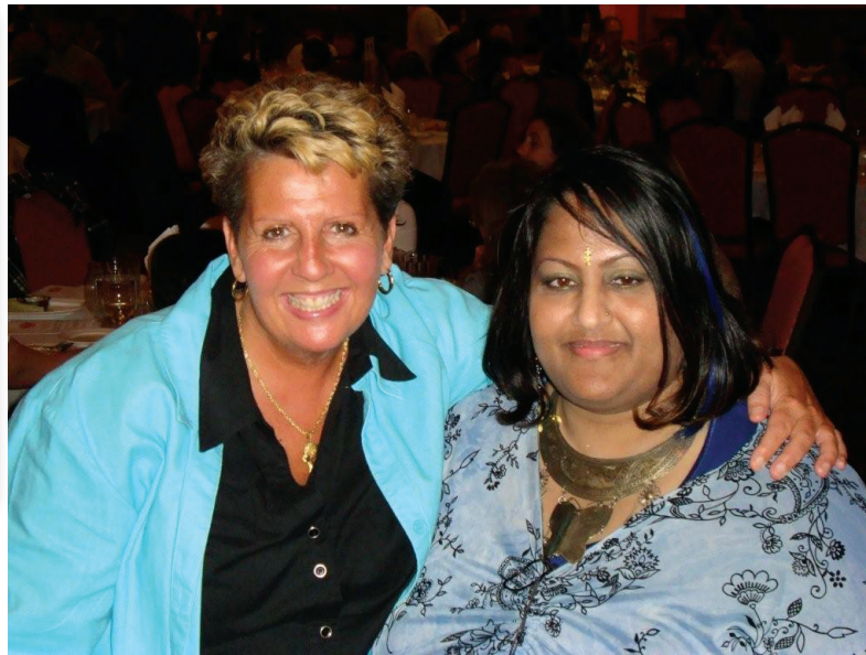
members on the town, at events and in the community