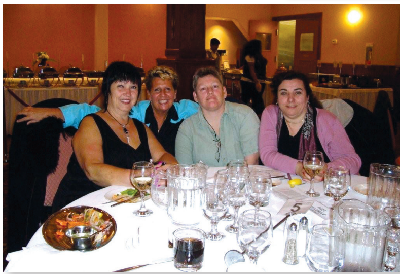
Uniting Diverse Communities to End Violence Against Women dinner