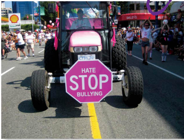
Vancouver Pride Parade