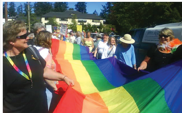
Salt Spring Pride Parade