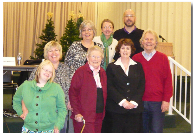
Panelists from Skills & (Dis)Abilities forum in Victoria