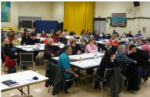
Participants at the Skills & (Dis)Abilities forum in Victoria

In both Vancouver and Victoria, many groups called for increased efforts to raise public awareness of issues affecting adults with developmental disabilities and their