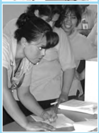
HEU reorganized more than 3,000 newly privatized workers.

"A basic element of the duty to bargain in good faith is the obligation to actually meet and to commit time to the process. The parties have a duty to engage in meaningful dialogue, to exchange and explain their positions and to make a reasonable effort to arrive at an acceptable contract."