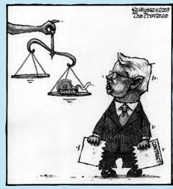
BOB KRIEGER ILLUSTRATION. USED WITH PERMISSION. ALL PROCEEDS TO THE FOOD BANK

JUNE 8, 2007 The Supreme Court of Canada hands down landmark decision ruling key sections of Bill 29 unconstitutional and establishing free collective bargaining as a protected right under the Canadian Charter of Rights and Freedoms.