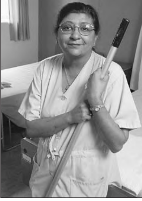
Bill 29 shredded key collective agreement protections and facilitated the largest mass firing of women workers in Canadian history.