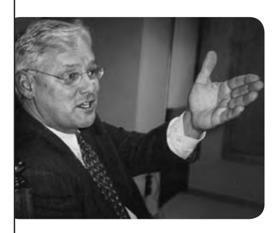
"First of all, I don't believe in ripping up agreements... I have never said I would tear up agreements... I am not tearing up any agreements." GORDON CAMPBELL,

The BC Liberals' unprecedented 2002 legislation gutted the bargaining rights of health and social services workers and paved the way for massive job losses and privatization in the health care sector.