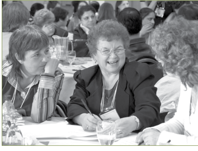
Above: Delegates exchange ideas and information about their bargaining priorities and goals. Right: Members answer the question, "What does a living wage mean to me?"

Delegates also discussed the advantages of coor-