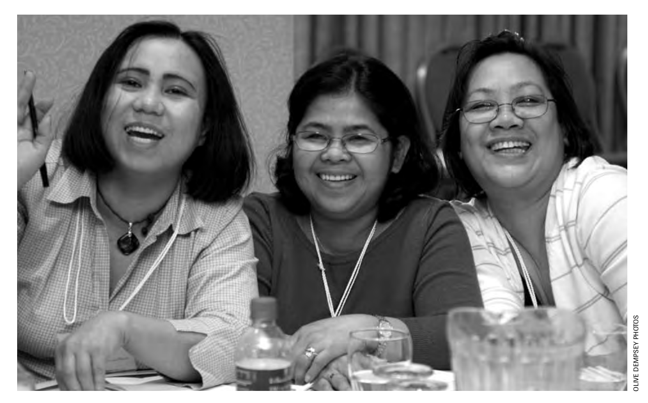
Despite serious discussions, delegates stayed in high spirits throughout the two-day bargaining conference.

The march drew attention and support from passersby, with photos appearing in news stories in Vancouver and Nanaimo the following day.