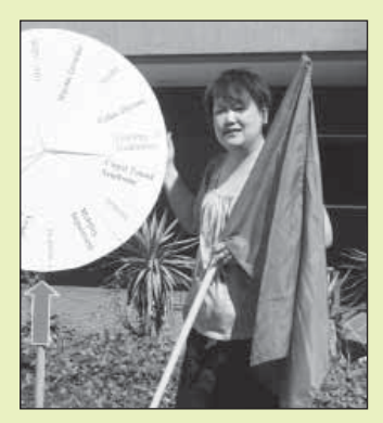
Children's and Women's Wheel of Chance

together to answer the questions. Other activities included a workload survey that ran throughout the month of April