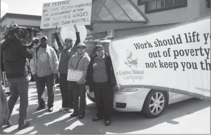
In May, Living Wage member activists delivered the 15,000-strong living wage petition to Premier Gordon Campbell at a campaign stop in Burnaby.

All of the contracts also achieved significant health and safety improvements, which give members the ability to take action on their need for adequate supplies, appropriate protective equipment, necessary training, workload issues, and more. The agreements also include new rights for casual workers, such as access to benefits, seniority and regular shifts.