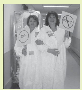
Nanaimo's Do and Don't

They visited all departments with prepared quizzes for each, and encouraged members to put their heads