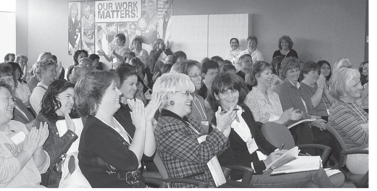
HEU's first-ever occupational conferences in 2005 forged new ground in the union's bargaining preparations.